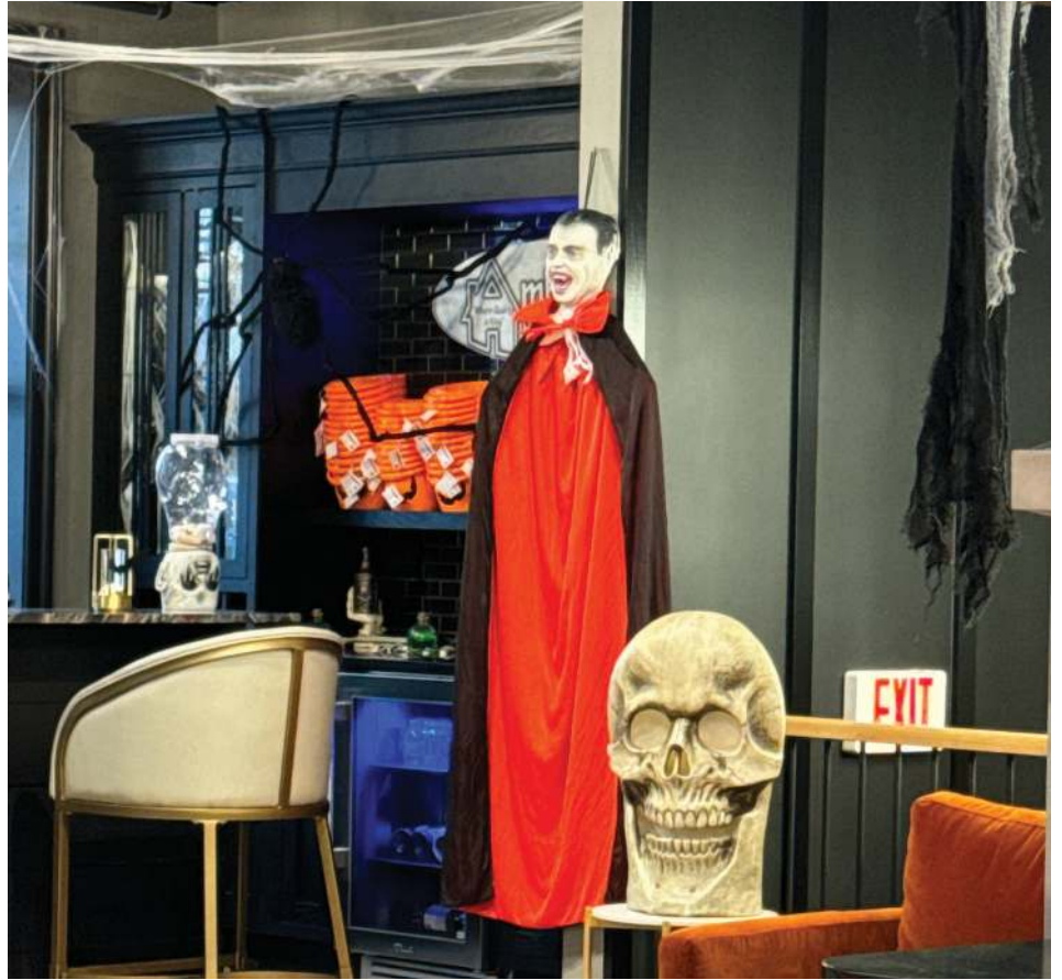
SHOWROOM HAUNTED HOUSE