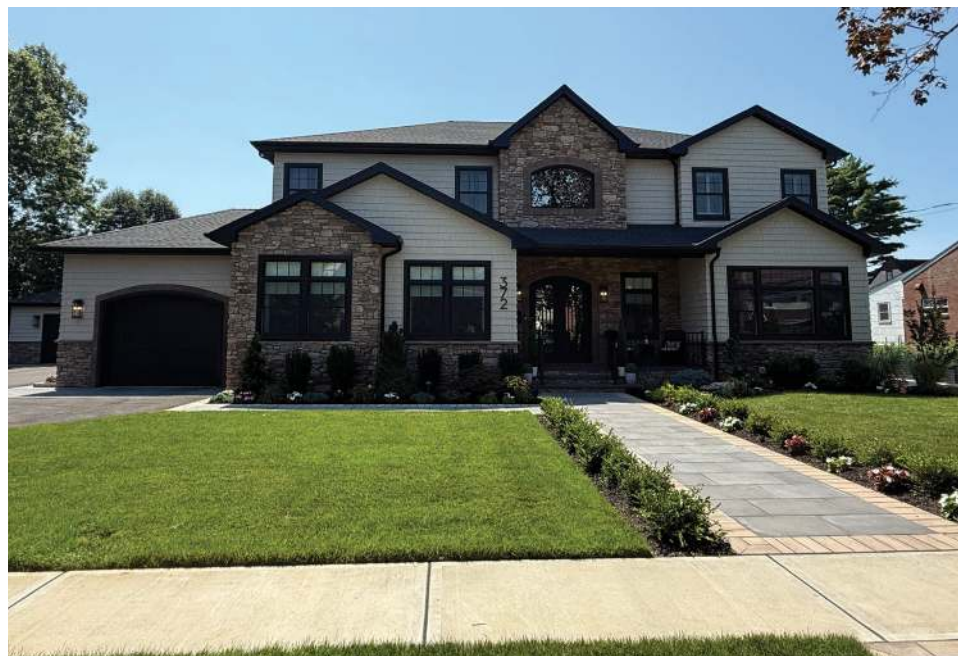
NEW HOME CONSTRUCTION