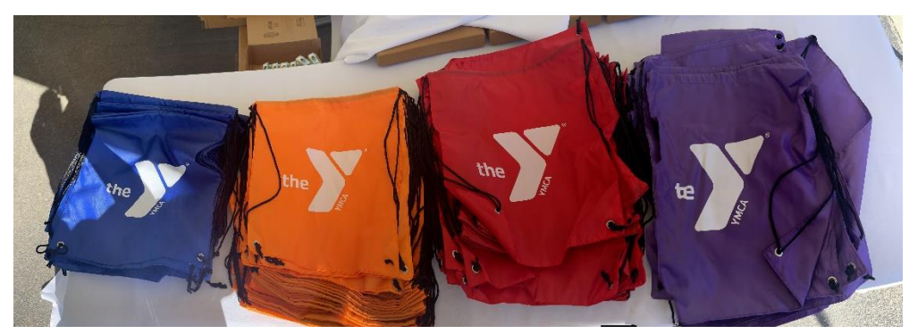
Y branded Vinyl Draw String Backpacks gifted by Gieger.

YMCA of Long Island Team and Volunteer Team pose with the packed backpacks.