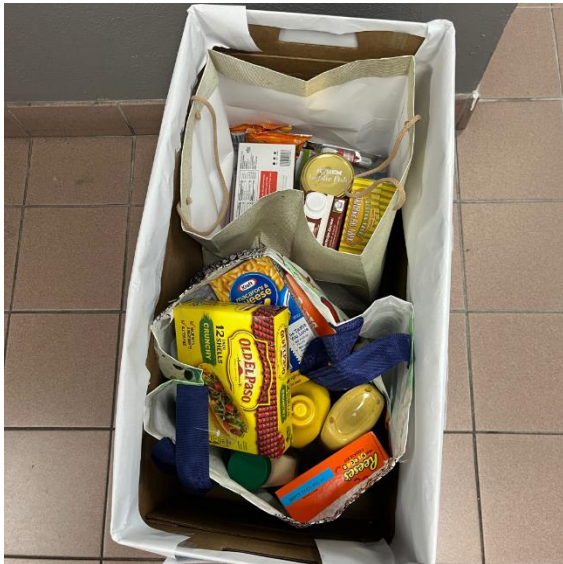
Food Drive Box at the YMCA at Glen Cove Lobby