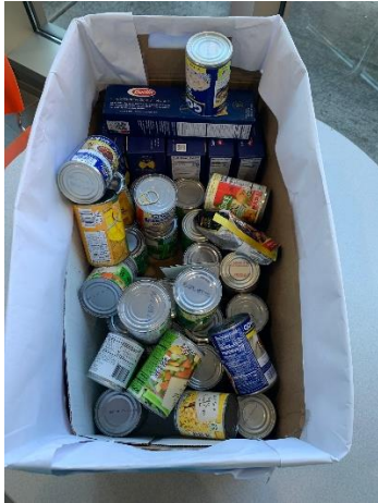
Food Drive Box at the Patchogue Family YMCA Lobby